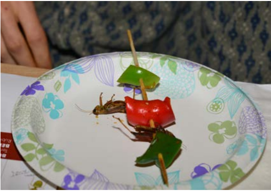
Danielle Wishon savoring a grasshopper: